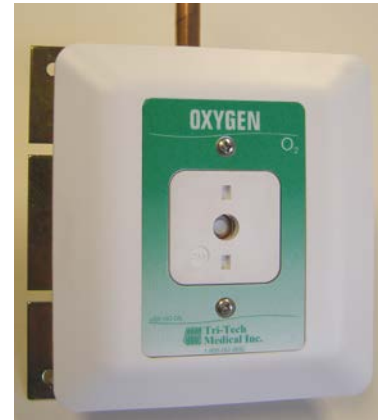
Outlet XQ1124 Shown

The outlet nameplate shall be permanently color coded with a durable, scratch resistant and protective label. The outlet trim plate shall be durable plastic, attached