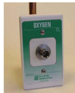
XF5724A with XC1000-10 trim plate

Medical gas outlets shall be cleaned for oxygen service in accordance with the current Compressed Gas Association (CGA) Pamphlet G-4.1, capped and placed in a protective container for shipment. The outlets shall be installed in strict accordance with manufacturer’s instructions, and tested before use in conformance with NFPA 99, local and state codes.