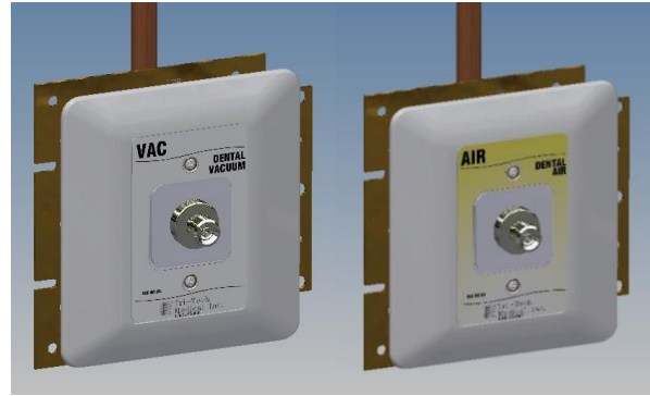
Shown above Dental Vacuum Part Number TDN91XF1122 and Dental Air Part Number TDN91XF112080

no secondary check for vacuum or WAGD services. Medical gas outlets which require the removal of the nameplate or gas specific components for routine service shall not be