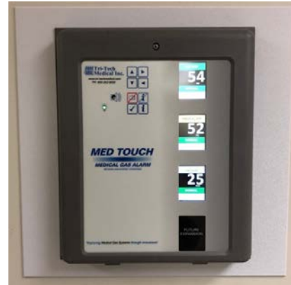
(Example: TP18182W with a T2U7OAVF installed)