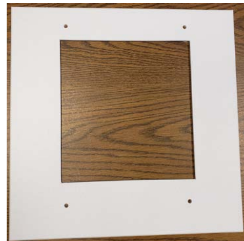
2 Slot Conversion Alarm P/N TP18182W Trim Plate