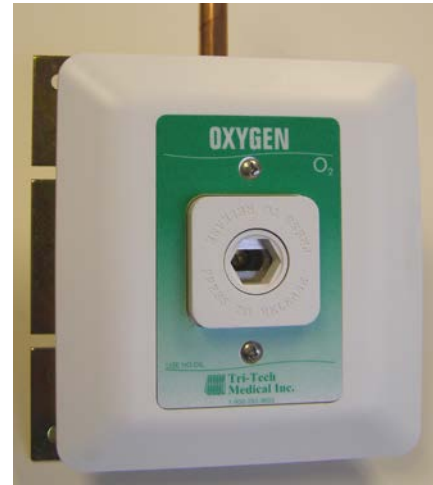
Part Number XP1124 Shown

The outlet nameplate shall be permanently color coded with a durable, scratch resistant and protective label. The outlet trim plate shall be durable plastic, attached with the nameplate to the rough-in assembly, and provide automatic plaster adjustment from 1/2 to 1 1/4