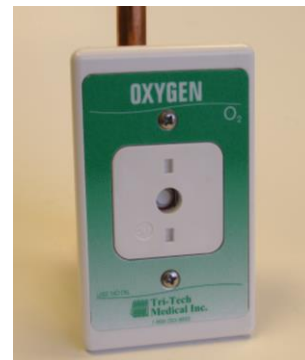
XQ5724 with XC1000-10 trim plate

Medical gas outlets shall be cleaned for oxygen service in accordance with the current Compressed Gas Association (CGA) Pamphlet G-4.1, capped and placed in a protective container for shipment. The outlets shall be installed in strict accordance with manufacturer’s instructions, and tested before use in conformance with NFPA 99, local and state codes.