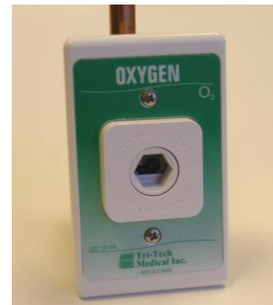
XP5724 with XC1000-10 trim plate

Medical gas outlets shall be cleaned for oxygen service in accordance with the current Compressed Gas Association (CGA) Pamphlet G-4.1, capped and placed in a protective container for shipment. The outlets shall be installed in strict accordance with manufacturer’s instructions, and tested before use in conformance with NFPA 99, local and state codes.