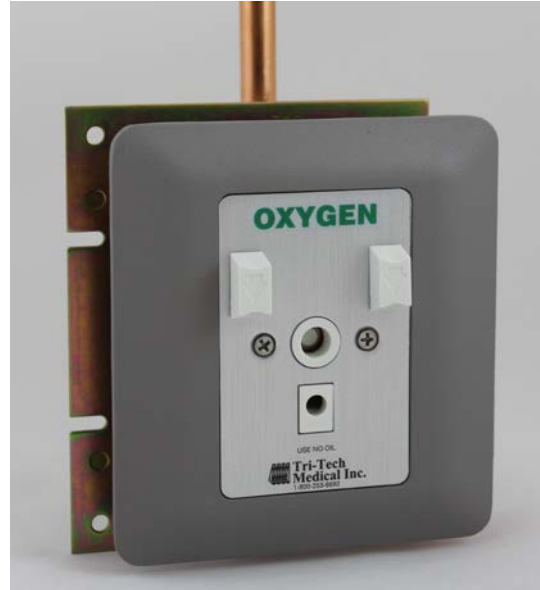
Part Number ALN91XA1124 Shown

in assembly, and provide automatic plaster adjustment from 1/2 to 1 1/4 of an inch (1.3 cm to 3 cm).