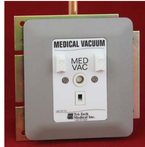
Part Number DPN91XA1122 Shown

rough-in assembly, and provide automatic plaster adjustment from 1/2 to 1 1/4 of an inch (1.3 cm to 3 cm).