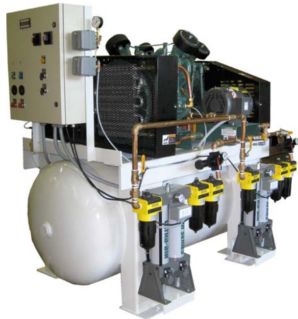
Tank-Mounted Model DINSA10R200HTD1 Your system can look different

BASIC NEMA 12 enclosed UL listed NFPA Control Panel features externally operable circuit breakers with door interlock, control circuit transformers with fused primary and secondary coils, H-O-A switches, run light, hour meter, magnetic starter with 3 leg overload