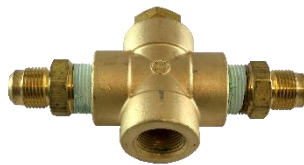
17-0434 Vaporizer Inlet Sub-Assembly for two transfer hoses 3/4" FNPT x two CGA 440 Oxygen male