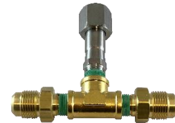
17-0437 Vessel Equalizer Sub-Assembly CGA 440 Oxygen female x two CGA 440 Oxygen males